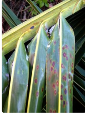
Photo 1. Oval spots with small grey centres and dark brown margins of Pseudoepicoccum cocos .