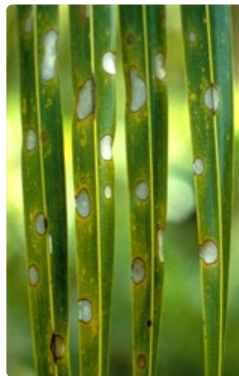
Photo 3. Spots of grey leaf spot, Pestalotiopsis palmarum .