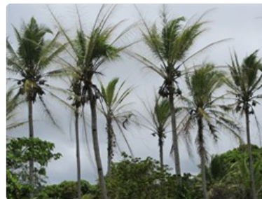
Photo 4. Group of coconuts attacked by the stick insect, Graeffea crouani .