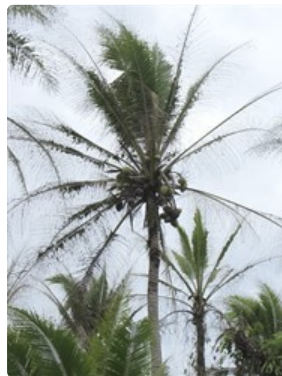
Photo 5. Close up coconut palm attacked by the stick insect, Graeffea crouani . Note that the palm is recovering from the attack.