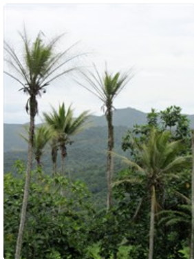
Photo 3. The stick insects, Graeffea crouani , have stripped the coconut fronds leaving only the midribs.