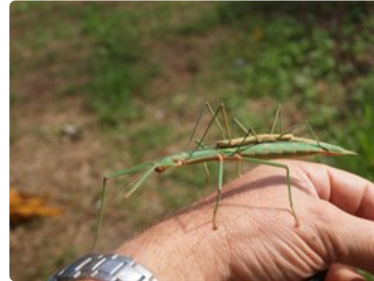
Photo 2. Male and female stick insect, Graeffea crouani .