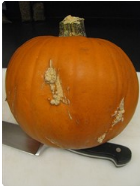
Photo 3. Wart-like symptoms of a pumpkin caused by oedema.