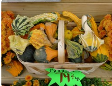
Photo 1. Collection of gourds in a supermarket in Cincinnati, USA.