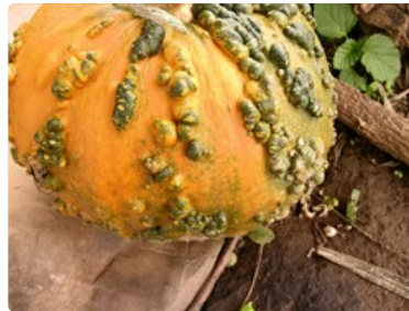
Photo 2. Squash from Bolivia, South America, said to be a varietal characteristic.