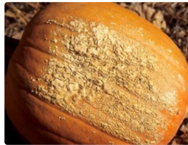
Photo 4. Oedema on pumpkin. Note that it is on one side, that facing the ground.