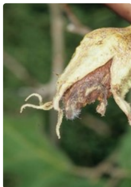
Photo 5. Choanephora cucurbitarum blossom blight.