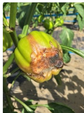
Photo 6. Cucurbit wet rot, Choanephora cucurbitarum , on capsicum. Possibly, the wet rot has followed damage caused by anthracnose or sunscald.