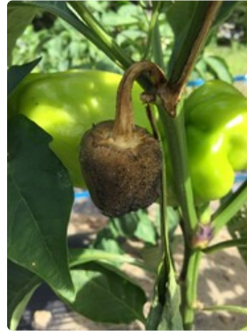
Photo 2. Cucurbit wet rot, Choanephora cucurbitarum , on capsicum.