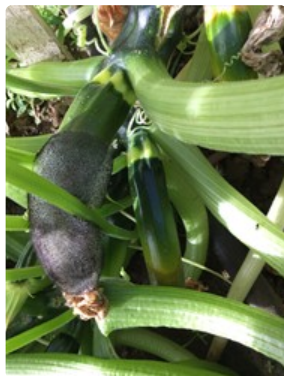
Photo 3. Cucurbit wet rot, Choanephora cucurbitarum , on zucchini. Similar to Photo 1.