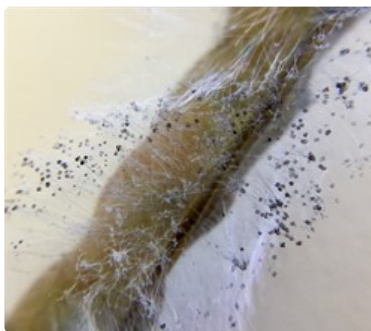
Photo 7. Spores of cucumber wet rot, Choanephora cucurbitarum , on bean.