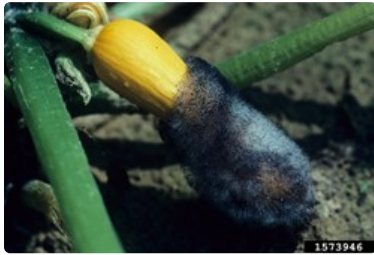
Photo 1. Cucurbit wet rot, Choanephora cucurbitarum , on fruit of squash near the soil surface. The fungus is forming dark spores giving the fruit a "hairy" look.