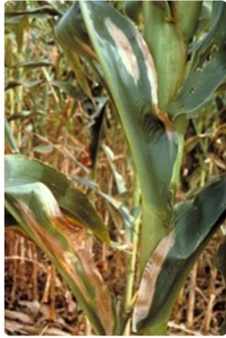
Photo 1. Large elongated grey spots of maize northern leaf blight, Setosphaeria turcica .