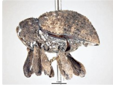
Photo 2. Adult mango pulp weevil, Cryptorhynchus frigidus .