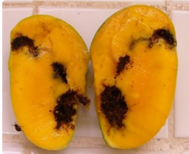
Photo 1. Mango cut open to show the damage and frass of the mango pulp weevil, Cryptorhynchus frigidus .