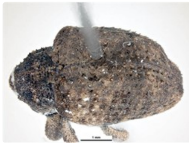
Photo 3. Adult mango pulp weevil, Cryptorhynchus frigidus (above).