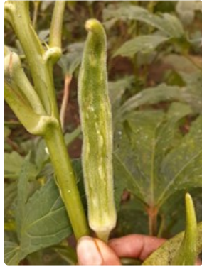
Photo 1. Bumps and ridges on okra pods, some in lines, caused by unknown condition (Fiji).