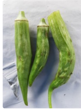
Photo 2. Numerous bumps and ridges on okra pods causing distortions (Fiji).