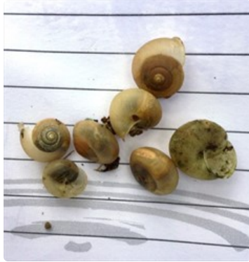
Photo 1. Collection of Asian tramp snails, Bradybaena similis , showing the variation of shell colour.