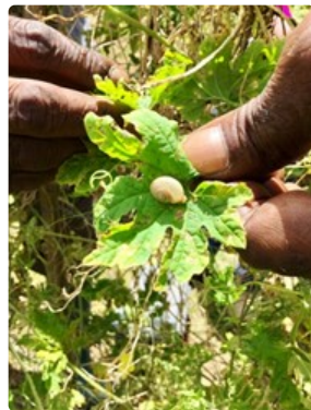
Photo 3. Asian tramp snail, Bradybaena similis , on bitter melon.