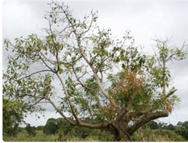
Photo 1. Dieback of avocado, Phytophthora cinnamomi ; note that this tree is losing its leaves, so that the fruit are exposed. The branches will rapidly die from the tips.