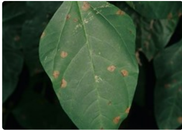
Photo 1. Leaf spot of Cercospora canescens on long bean.