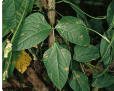
Photo 2. Leaf spot of Cercospora canescens on long bean.