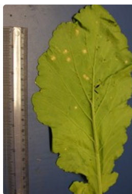
Photo 5. Pustules of white blister rust, Albugo candida , on leaves of Indian mustard.