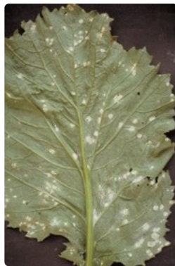
Photo 3. Pustules of white blister rust, Albugo candida , on the underside of a Chinese cabbage leaf. The pustules have burst and are releasing the powdery spores. On the upper surface the spots are yellow-green.