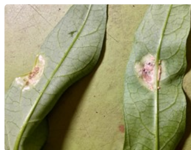
Photo 6. White blister rust, Albugo species, on Ipomoea aquatica (Tonga).