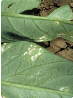
Photo 1. White rust (or white blisher rust), Albugo ipomoeae-aquaticae , on the underside of kangkong, Ipomoea aquatica .