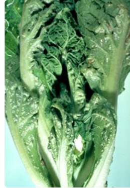
Photo 2. Blisters of cabbage white rust, Albugo candida , on the outer leaves of Chinese cabbage (especially top right and bottom left).