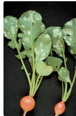
Photo 4. Pustules of white blister rust, Albugo candida , on the underside of radish leaves. The pustules are round at first, smooth, white and shiny. Later, they are powdery after they have burst to release the spores. Severe infection causes leaves to become distorted and to die early.