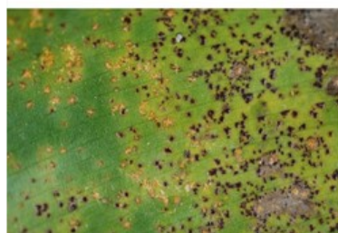
Photo 4. Dark brown structures developing which contain the teliospores of Puccinia thaliae .