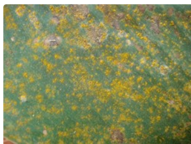
Photo 3. Close-up of the powdery masses of Puccinia thaliae spores, released from pustules on the lower surface of the leaf.