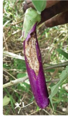
Photo 8. Damage to eggplant by the Caribbean leatherleaf slug, Sarasinula plebeia .