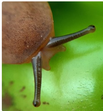
Photo 3. Antennae of the Caribbean leatherleaf slug, Sarasinula plebeia , with eyes at the ends.