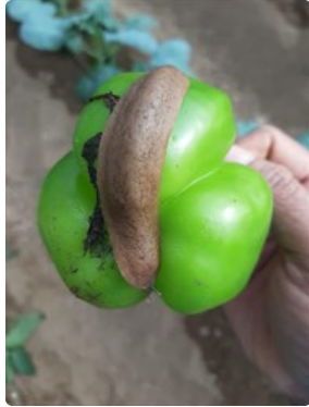
Photo 1. The Caribbean leatherleaf slug, Sarasinula plebeia , moving over a capsicum fruit.