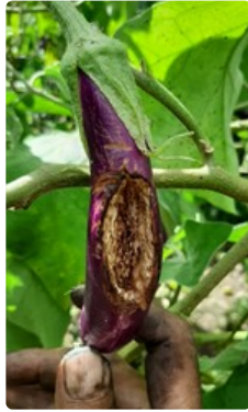
Photo 7. Damage to eggplant by the Caribbean leatherleaf slug, Sarasinula plebeia .