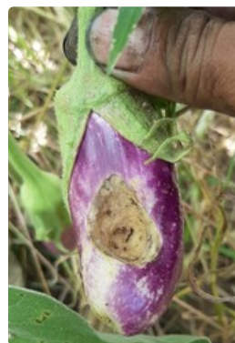
Photo 6. Damage to eggplant by the Caribbean leatherleaf slug, Sarasinula plebeia .