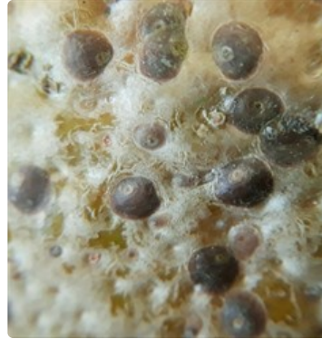
Photo 2. Enlargement of Photo1 showing sub-circular female cashew scales, Pseudaonidia trilobitiformis , and the off-centre skin of the earlier moult.