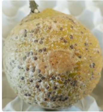
Photo 1. Cashew scale, Pseudaonidia trilobitiformis , on skin of orange.