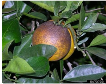
Photo 2. Citrus rust mite, Phyllocoptruta oleivora , damage on an orange.