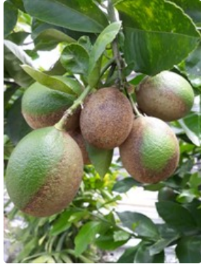
Photo 1. Citrus rust mite, Phyllocoptruta oleivora , on limes, clearly showing the contrast between the damaged and healthy parts of the fruit.