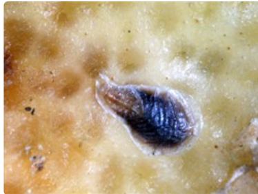
Photo 1. Female citrus snow scale, Unaspis citri . The female is very different from the male; it is oval, brown-black and 2 mm long, whereas the male is 1 mm, and white.