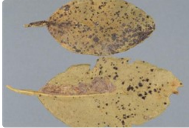
Photo 1. Lower surface of citrus leaf showing spots caused by sooty blotch, Meliola citricola .