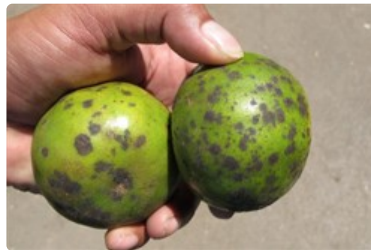
Photo 3. Sooty blotch on orange, caused by Meliola citricola .