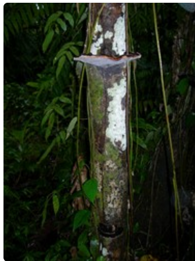
Photo 3. Bracket belonging to Phellinus noxius on a forest tree left for shade adjacent to the cocoa tree with a sterile "stocking" (seen in Photo 1).