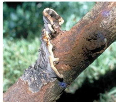
Photo 4. Bracket of Phellinus noxius on the trunk of Leucaena leucocephala .