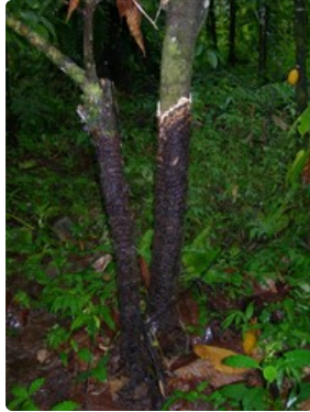
Photo 1. Sterile crust of Phellinus noxius on the outside of cocoa trunks. The brown crust has a distinct white margin.