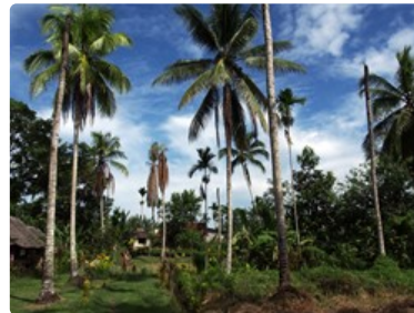
Photo 2. Coconuts showing signs of Bogia syndrome, whereas the betel nuts are mostly healthy.