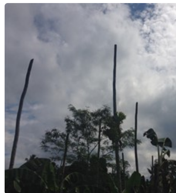
Photo 4. In many plantations in Madang Province, Papua New Guinea, coconut palms have been killed by Bogia coconut syndrome.