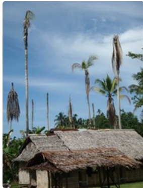
Photo 1. Dying and dead coconut palms with Bogia coconut syndrome, Madang Province, Papua New Guinea.