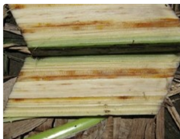
Photo 5. Streaks and bands of rots in the vascular tissues of a banana with banana wilt associated Bogia phytoplasma disease.