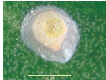
Photo 2. Female coconut scale, Aspidiotus destructor . Note that the body of the insect can be seen beneath the scale, hence the alternative name of "transparent scale".