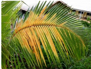
Photo 1. Coconut frond showing damage due to coconut scale, Aspidiotus destructor .