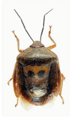
Photo 1. Axiagastus rosmarus . This is given as an example of a stink bug similar to Axiagastus cambelli .