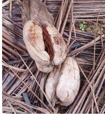
Photo 3 'Dry' nuts like those said to be produced on palms infested with Axiagastus cambelli . (This image was taken in Guam and sent to www.pestnet.org for identification.)