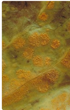
Photo 3. Close-up of the powdery spore masses of coffee rust, Hemileia vastatrix , on the underside of a coffee leaf at a late stage of infection when many of the spots have merged.