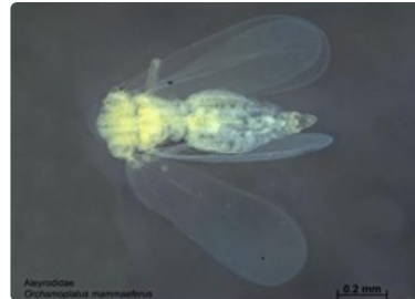
Photo 2. Adult croton whitefly, Orchamoplatus mammaeferus .