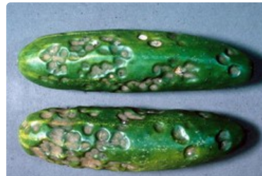
Photo 4. Sunken spots on cucumber caused by anthracnose, Colletotrichum orbiculare .