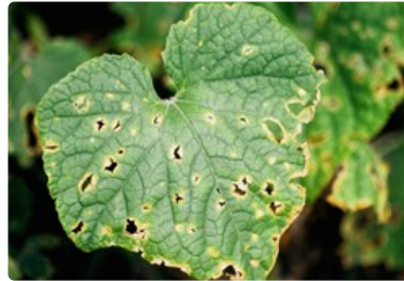
Photo 2. Round and oval light brown spots showing "shot-hole" symptom on cucumber, caused by the anthracnose fungus, Colletotrichum orbiculare .