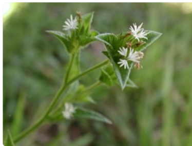
Photo 3. Flowerhead, elephant's foot, Elephantopus mollis .