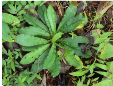
Photo 2. Rosette of leaves, elephant's foot, Elephantopus mollis .