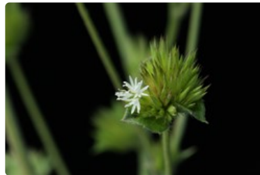
Photo 4. Close-up flowerhead, elephant's foot, Elephantopus mollis . Note the leaf-like bracts under the flowers.