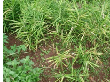
Photo 2. Ginger with soft rot, Pythium sp., showing drying-up of the leaves and collapse of the plants.