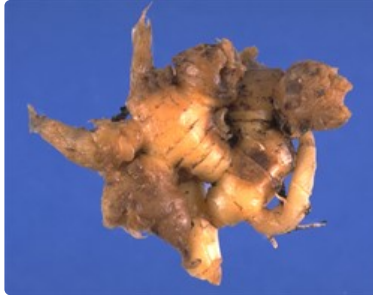
Photo 1. Ginger rhizome with severe soft rot, Pythium sp. affecting the young buds and shoots.