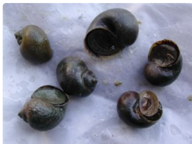
Photo 1. Golden apple snail, Pomacea species (Thailand). Note the 'operculum' closing the opening of the shell.