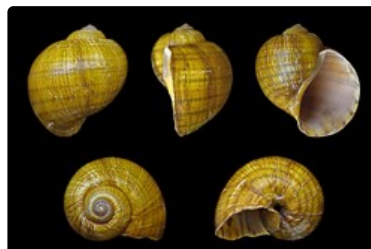
Photo 2. Golden apple snail, Pomacea canaliculata , tan with brown bands.