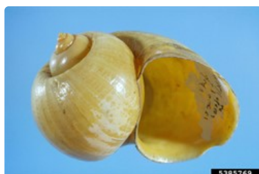
Photo 3. Golden form of the golden apple snail, Pomacea canaliculata .