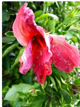
Photo 3. More extensive damage by the hibiscus flower-eating beetle.