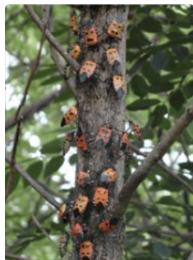
Photo 5. Aggregating adult man-faced stink bug, Catacanthus incarnatus (India).