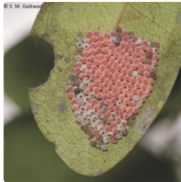
Photo 4. Eggs of the man-faced stink bug, Catacanthus incarnatus .