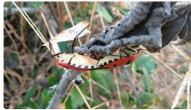
Photo 2. Adult, man-faced stink bug, Catacanthus incarnatus , mating.