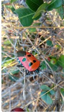
Photo 1. Adult, man-faced stink bug, Catacanthus incarnatus . Note, there are cream, orange and yellow types too.