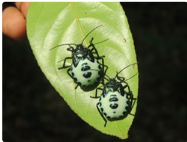
Photo 3. Nymphs of the man-faced stink bug, Catacanthus incarnatus .