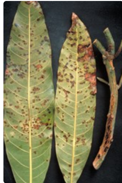
Photo 1. Angular spots on the leaf, and cankers on the stem, caused by bacterial black spot, Xanthomonas axonopus pv. mangiferaeindicae .