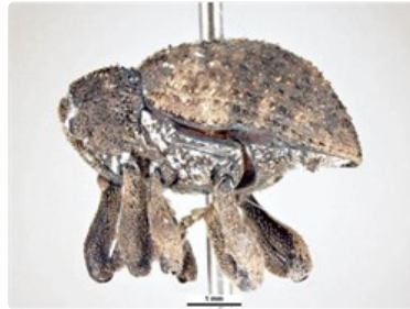
Photo 2. Adult mango pulp weevil, Cryptorhynchus frigidus .