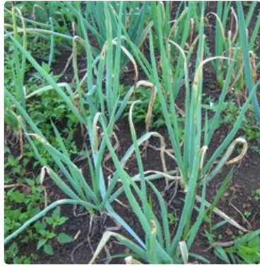
Photo 1. Purple blotch, Alternaria porri , causing spots on leaves of shallots.