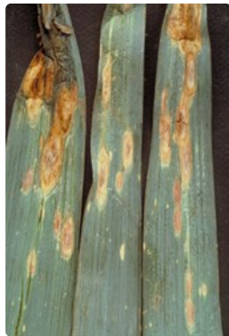
Photo 3. Leaf-tip dieback on leek, caused by the purple blotch fungus, Alternaria porri .