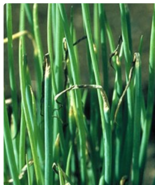
Photo 5. Leaf-tip dieback on shallot, caused by the purple blotch fungus, Alternaria porri .