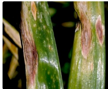
Photo 4. Purple blotch caused by Alternaria porri , on onion. The large spots are oval, purple and up to 150 mm long.