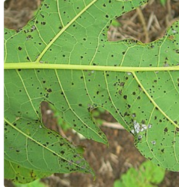
Photo 2. Close-up of underside of a papaya leaf showing black spot, Asperisporium caricae .