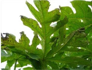
Photo 1. Black spot of papaya, Asperisporium caricae , on the underside of the leaf. Large numbers of spots cause the leaves to dry, die and fall.