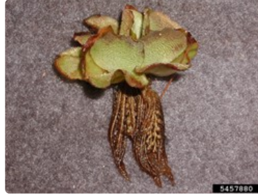
Photo 2. Leaves (fronds) and roots of salvinia, Salvinia molesta , growing at low density.