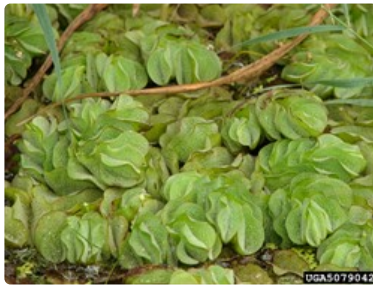
Photo 3. Leaves (fronds) of salvinia, Salvinia molesta , become folded when growing at high density.