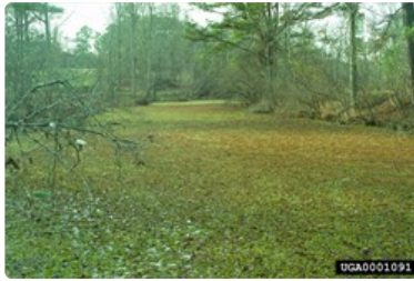
Photo 1. Salvinia, Salvinia molesta , causing extensive blockage of a river in the USA.