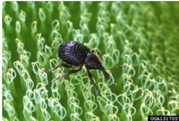
Photo 5. Weevil, Cyrtobagous singularis , walking on the hairs on the upper surface of a salvinia leaf, Salvinia molesta . This species is similar in its biology to Cyrtobagous salviniae , and is also a biocontrol of salvinia.