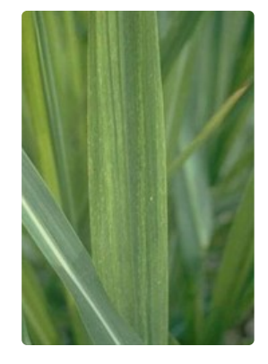
Photo 2. Leaves showing yellow streaks (2-5 mm wide) along the blade, typical of Ramu stunt disease on susceptible varieties of sugarcane.