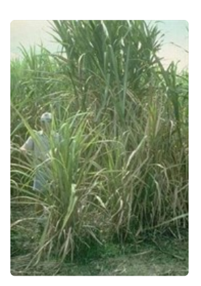
Photo 1. Stunted plant (foreground) showing symptoms typical of Ramu stunt disease.