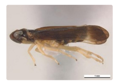
Photo 4. Side view of Eumetopina flavipes , the planthopper that spreads Ramu stunt disease.