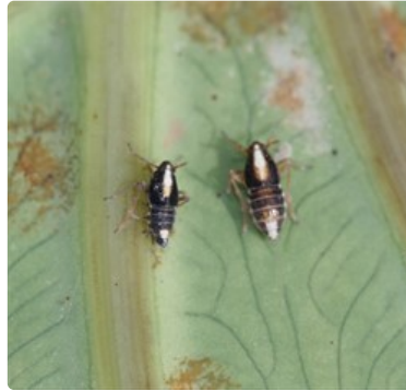
Photo 2. Mature, wingless, forms of Tarophagus species.