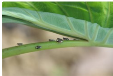
Photo 3. Tarophagus planthoppers prefer sites on the plant where humidity is highest, either within the rolled leaf, on the petioles beneath the leaf blade or between the petioles at the base of the plant.