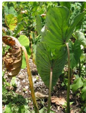
Photo 5. Large numbers of Tarophagus sp. on taro in the field.