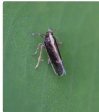
Photo 4. Winged form of Tarophagus species.