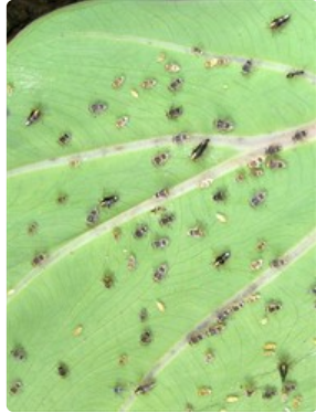
Photo 1. Different stages of Tarophagus species. Note some of the mature forms have wings.