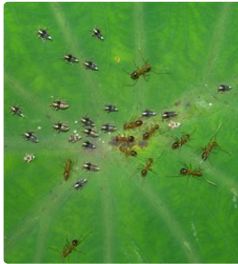
Photo 7. Mature forms of Tarophagus species and ants; the latter are attracted to the honeydew produced by the planthoppers.