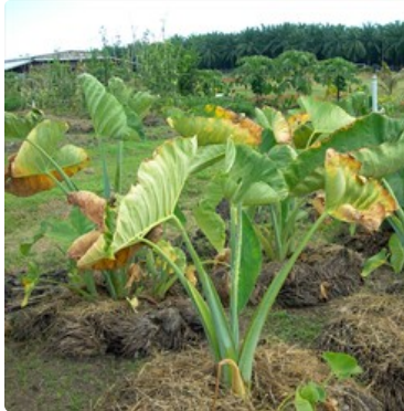
Photo 1. The beginning of symptoms on cocoyam, Xanthosoma , showing early death of the older leaves caused by Pythium sp. (Solomon Islands.)