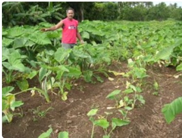
Photo 3. Typical dieback caused by Pythium root rot. Notice the disease has travelled down a row, most likely by root-to-root contact. (Cook Islands.)