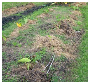
Photo 6. Cocoyam with Pythium infection soon after planting. The plants remain stunted with one at most two leaves.