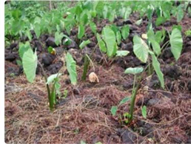
Photo 2. Pythium infection in Colocasia taro showing weak-looking plants with two at most three leaves, and new leaves which are stunted and partly rolled. (Samoa.)