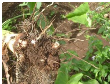
Photo 5. A plant from Photo 1, pulled up to show the decay of the roots. Notice the difference between the roots at the top of the picture, which are mostly without side (fine) roots, compared to those below.