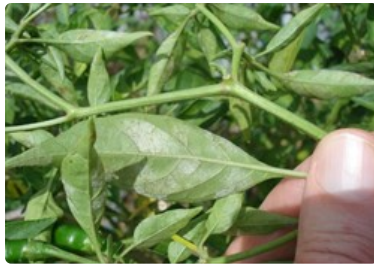
Photo 2. Symptoms of tomato powdery mildew, Leveillula taurica , on the underside of a chilli leaf. Note the patches are bordered by the main veins.