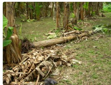
Photo 6. "Toppling" is a common symptom on banana when roots are attacked by Pratylenchus coffeae . Note this banana has fallen over before the fruits have matured; a sign of nematode attack. A similar symptom occurs when bananas are infected by the nematode Radopholus similis .