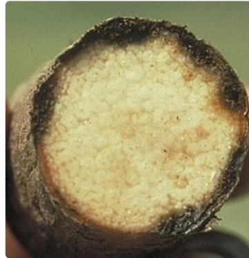
Photo 2. Pratylenchus coffeae in yam causes a shallow rot beneath the skin.