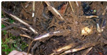
Photo 5. Banana roots with purple/black discoloration caused by Pratylenchus coffeae . Infected roots rot and plants are weak and yields are small.