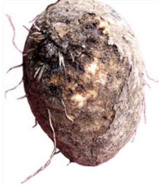
Photo 1. Pratylenchus coffeae in yam causes a shallow rot beneath the skin; the importance of the rot is not only the loss of flesh for eating, it is also the loss of planting material. Yams infected with dry rot do not sprout or, if they do, the cutting will be infested with nematodes which will attack the roots when the sets are planted.