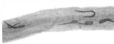
Photo 4. Pratylenchus coffeae inside a root.