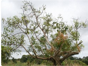
Photo 1. Dieback of avocado, Phytophthora cinnamomi ; note that this tree is losing its leaves, so that the fruit are exposed. The branches will rapidly die from the tips.