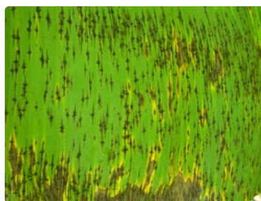
Photo 2. Dense infection of banana black cross, Phyllachora musicola .