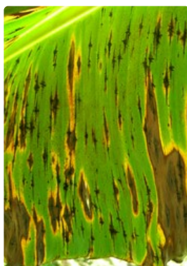
Photo 3. Spots of banana black cross, Phyllachora musicola , are entry points for Cordana musae .