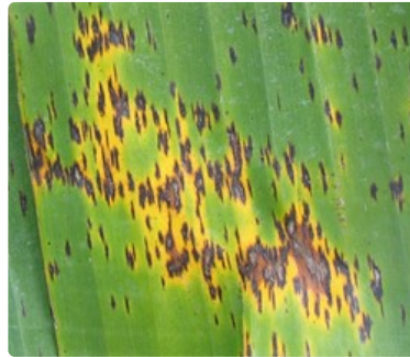
Photo 2. The brown or black streaks of Uredo musae , are often surrounded by yellow margins. The streaks feel rough to the touch.