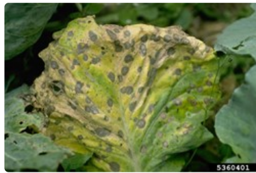
Photo 3. Grey leaf spot, Alternaria brassicae on cabbage.