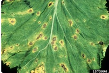
Photo 1. Cabbage grey leaf spot, Alternaria brassicae .