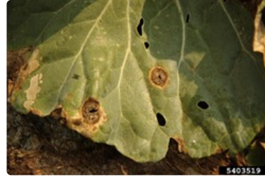
Photo 2. Grey leaf spot, Alternaria brassicae , on cabbage. Note the concentric rings typical of Alternaria infections.