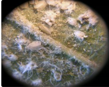
Photo 1. Adult Aleurotrachelus whitefly. Note the curly strands of wax.