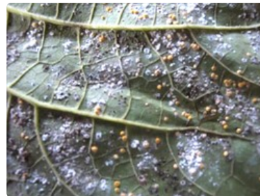
Photo 6. Fungus, probably Aschersonia sp. growing on pupae of the whitefly, Aleurotrachelus trichoides . As it produces spores so it becomes orange.