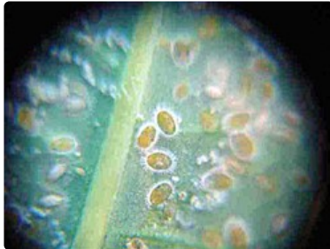
Photo 3. Larvae of the Aleurotrachelus whitefly at an early stage.