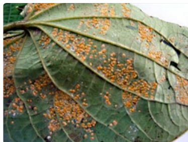
Photo 7. Complete colonisation of the pupae of Aleurotrachelus trichoides on the underside of a kava leaf by the fungus, Aschersonia sp.