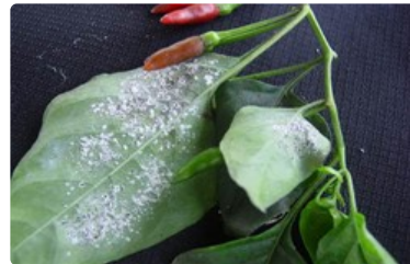
Photo 4. Late stage larvae of Aleurotrachelus whitefly which are now black.