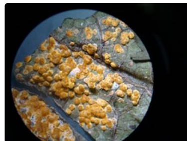
Photo 8. Magnified pupae of Aleurotrachelus trichoides showing that the fungus, Aschersonia sp. has formed a crust over them.