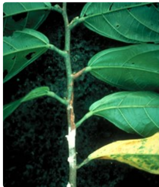
Photo 3. White sporulating growth of the vascular streak dieback fungus, Oncobasidium theobromae , on a cocoa branch.