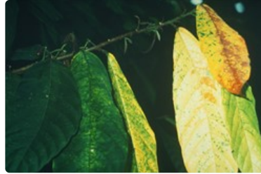
Photo 2. Yellow leaves with green spots, and abnormal development of axillary buds, on a cocoa branch affected by vascular streak dieback, Oncobasidium theobromae .