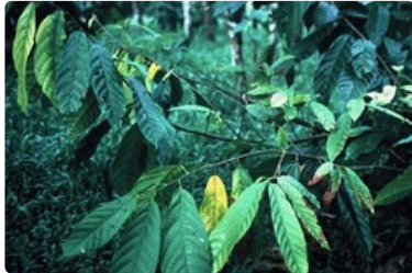
Photo 1. A branch affected by vascular streak dieback, Oncobasidium theobromae , where the leaves have mostly fallen.