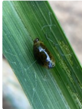
Photo 2. Hump-backed, black 'blob' of the larvae of Oulema species from Fiji.