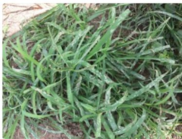
Photo 3. Damage by the leaf beetle, Oulema species to crowsfoot grass, Eleusine indica .