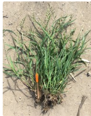
Photo 4. Damage by the leaf beetle, Oulema species, to barnyard grass, Echinochloa crus-galli .