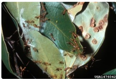
Photo 3. Nest from leaves held together by larval silk, green weaver ant, Oecophylla smaragdina .