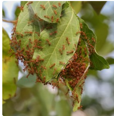
Photo 4. Green weaver ant, Oecophylla smaragdina , pulling leaves together and fastening with larval silk.