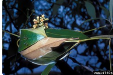
Photo 2. Nest from leaves held together by larval silk, green weaver ant, Oecophylla smaragdina .