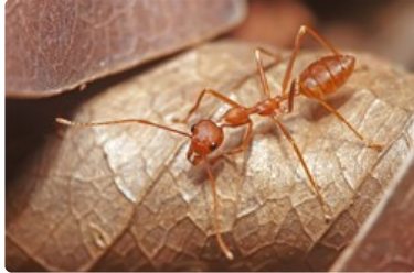
Photo 1. Major worker, green weaver ant, Oecophylla smaragdina .