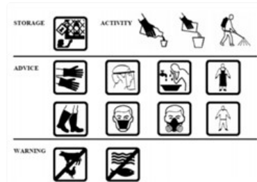
Diagram. FAO safety pictograms for pesticide labels.

Pesticide label for Attack (lower or right panel): Safety precautions, first aid and disposal.