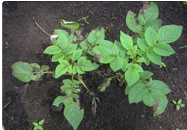
Photo 1. Symptoms of late blight on potato, Phytophthora infestans .