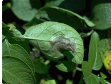
Photo 2. Underside of potato leaf with spot caused by late blight, Phytophthora infestans . Note spores form on the margin of the spot.