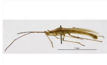
Photo 2. Adult rice seed bug, Leptocoris acuta , side view.